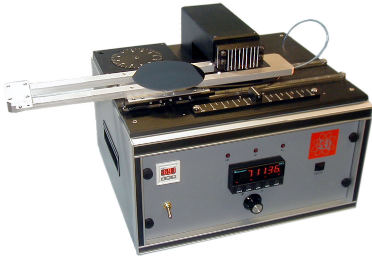
Model 1510M40 (Manual Measurement and Mapping System)

The LEI MODEL 1510M40 offers 1510-level measurement capabilities at a reasonable price perfect for university and low-volume production applications