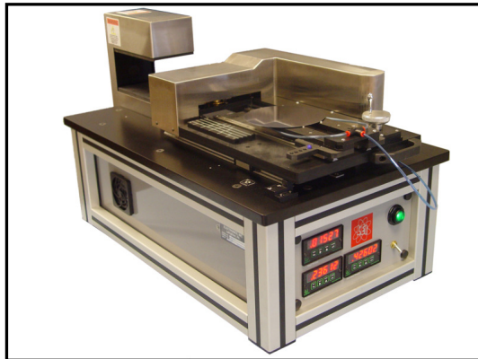
LEI Model 1605 Manual Positioning (Automatic positioning and Electromagnet also available)